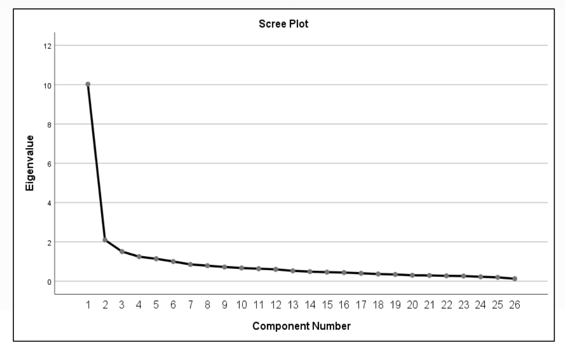
Figure 1. Scree plot

Since the correlation between items in the correlation matrix is r> 30, the items were found to be at the acceptable correlation level. The determinant value of the correlation matrix was determined to be greater than .0001. Multiple collinearities were not detected between the items (r> .80), and thus no item was removed from the scale. It was observed that the factor loads of the items in the matrix concentrate on four components. In this regard, considering the factor distribution of the scale as 4, the scree plot was evaluated.