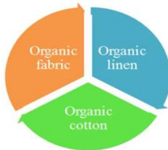
Figure 3: Sustainable raw materials of the garment industry

second-hand products in the workplace [25]. Organic linen and organic cotton are effectively useful for each customer to maintain a healthy lifestyle daily. Recycled fabrics are used by a pre-owned garment industry to enhance its rate of production and profitability successfully [26]. Every business activity aims to expand its business activity in different marketplaces, and ethical and sustainable manufacturing practices play an indispensable role to focus on specific aspects of this particular industry. Specializing in standards and certifications of an industry is managed with the help of ethical and sustainable practices.